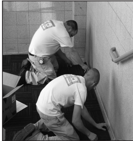
Wilhelm Commercial Builders working on the Druid Hill Y building as a part of the four-month revitalization project.